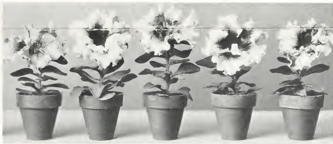
No. 8. Diener's Ruffled Monsters in 3-inch pots, 12 weeks after sowing